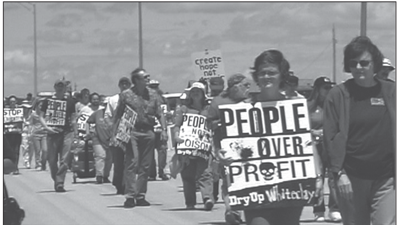
Three hundred people marched into Whiteclay June 11 to protest alcohol sales in this Nebraska border town.

If after all this time, though, there was still some confusion in political circles about this whole Whiteclay thing and what exactly's going on there, that ended May 15 with the publication of the Lincoln Journal Star's 16-page, full-color special report on the social and cultural devastation wreaked by alcohol on the Pine Ridge Reservation. The product of a year and a half of investigative research, the "At the Crossroads" tabloid placed this northwest Nebraska hamlet indelibly on the Nebraska map and pushed Whiteclay smack into the political limelight. It also, coincidentally enough, ushered in a blitz of media coverage about several