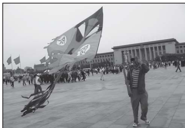
Kite flying on Tiananmen Square in Beijing, the site of the 1989 democratic protests against the government.

The Peking duck, one of the 115 million served by the 143-year-old restaurant in Beijing, was an exotic dining experience. However, what was more fascinating was my dinner conversation with a young Chinese employee of the Chinese People's Association for Friendship. He lives in the outskirts of Beijing, in a two-bedroom apartment in one of the many newly built high-rise buildings. He shares his home with his wife, who teaches full time, his only child, and his parents. Both parents were retired. Men retire at 60, women at 55, apparently to make employment available for the new generation of workers. This family admitted that they could