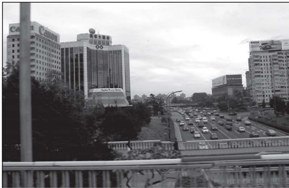
Modern street scene in metropolitan China