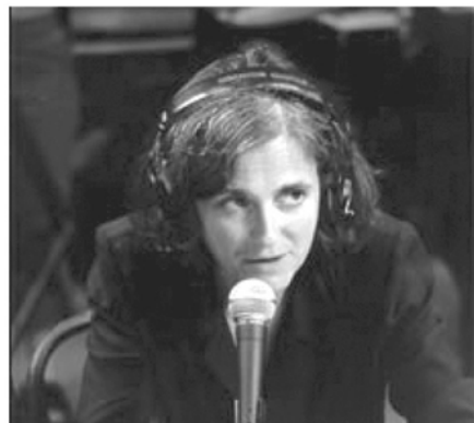
Amy Goodman, host of Democracy Now addressed a Lincoln audience at the Mary Riepma Ross Media Arts Center in April 2005.

Now airing on Nebraska's first-and-only non-profit, community radio station, KZUM 89.3 FM Monday-Friday, Noon-1 pm.